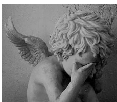
My Guardian Angel, most days -Editor